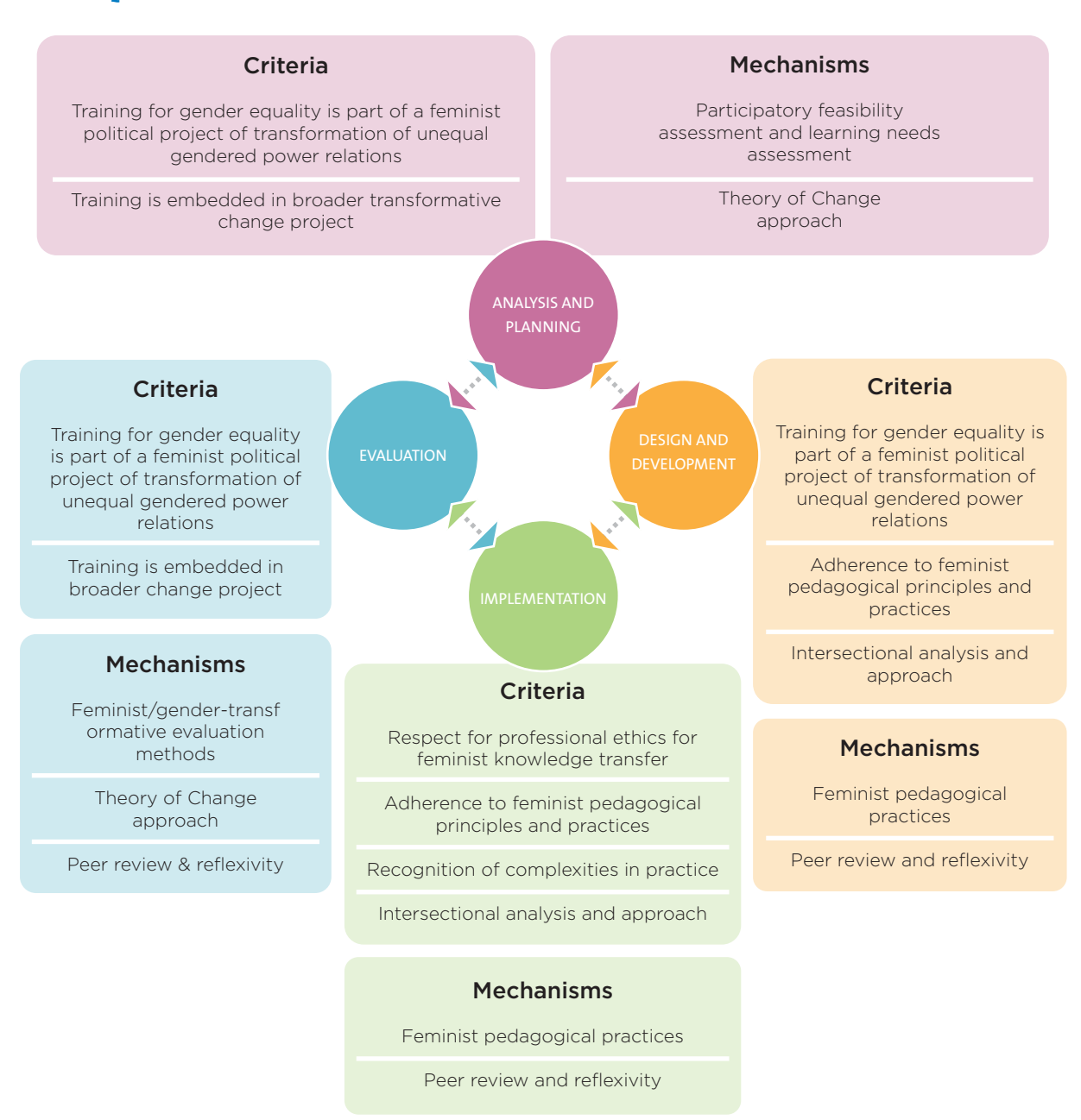
FIGURE 3 – THEORY OF CHANGE AND FEMINIST PEDAGOGIES AS BUILDING BLOCKS FOR QUALITY TRAINING FOR GENDER EQUALITY

The UN Women Training Centre recognises challenges involved in developing quality criteria for training for gender equality. This Statement is intended as a call for practitioners, trainers and experts to collectively explore how Quality Criteria and Quality Assurance Mechanisms could be developed for different institutions and contexts across the field of training for gender equality.