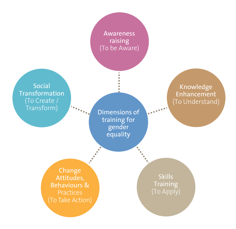
FIGURE 2. FIVE BROAD DIMENSIONS OF TRAINING FOR GENDER EQUALITY

The following outlines of five broad dimensions of training for gender equality stand to contribute to each stage of the training cycle. In particular, they are useful for supporting the planning, development and design stages of training initiatives.