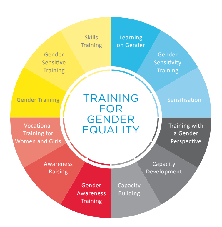
FIGURE 1. TERMS USED INTERCHANGEABLY ACROSS THE BEIJING REVIEW PROCESS TO REFER TO TRAINING FOR GENDER EQUALITY. ADAPTED FROM THE UN WOMEN TRAINING CENTRE'S PUBLICATION "TRAINING FOR GENDER EQUALITY: TWENTY YEARS ON" (2015).

It is important to distinguish between training and "capacity development", a term which is attributed distinct meanings in different spheres and by diverse actors. The United Nations has defined capacity as "the ability of people, organisations and society as a whole to manage their affairs successfully". Capacity development has been taken to mean "the process whereby people, organisations and society as a whole unleash, strengthen, create, adapt and maintain capacity over time." (Capacity development should not be used as a synonym for